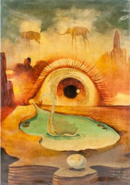
Salvador Dalí Surrealist Scene