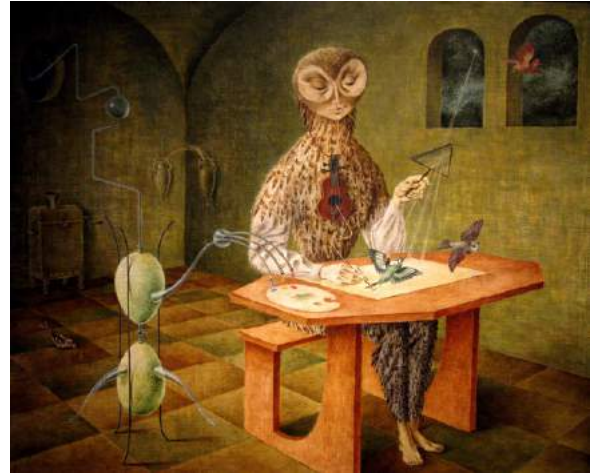
Remedios Varo, 1957 Creation of the Birds

Surrealism is an art movement that began about 100 years ago. Artists got tired of painting and drawing what they saw and decided to create art based on what they imagined and dreamed. Surrealist art can be wacky, funny or creepy. It can combine objects that we wouldn't normally find together to tell a strange story: The pictures above show a giant eye whose tear becomes a lake for a swan, fruit and dishes spiraling in the air around a candle, melting clocks draped over branches, and a weird woman in a feather costume drawing birds that come to life and jump off the page.