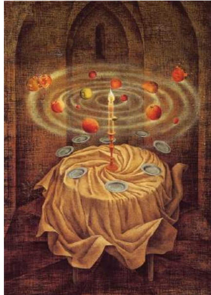
Remedios Varo, 1963 Still Life Reviving