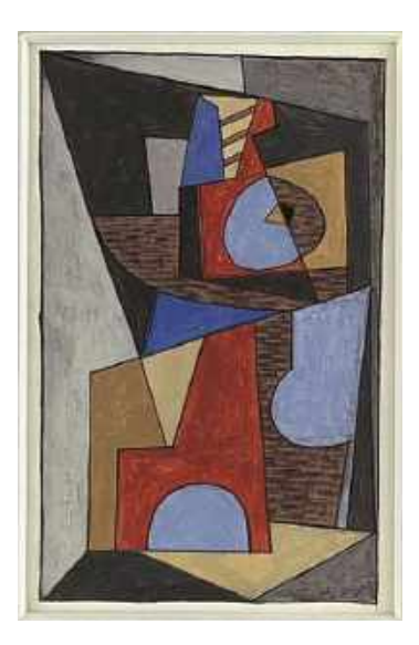
Pablo Picasso: Cubist Composition, 1910

Before we start the drawing, let's look at a couple of paintings by Picasso. Pablo Picasso (1881–1973) was born in Spain. He is one of the most famous artists of the 20th century. It is unknown who came up with the name "Picasso bug" for Sphaerocoris annulus , but they had a lot of imagination! Picasso worked in many styles and is famous for his abstract paintings. He also liked to make collages. Although we are going to give directions for using markers in today's project, you are welcome to collage your bug instead of coloring it after you cut it out.