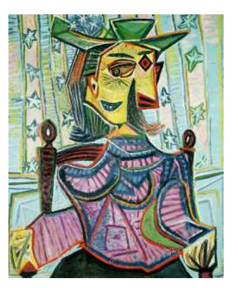
Portrait of Dora Maar, 1939

Supplies: White paper, pencil, eraser, scissors, markers, glue stick, construction paper