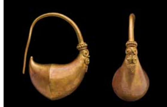
Dressed to Kill in Love and War: Splendor in the Ancient World Pair of East Greek boat-shaped gold earrings with spirals and granulation, Late 6th-early 5th century BC Greek silver cup, 4th-3rd century BC