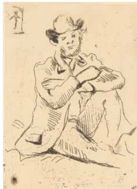
PAUL CÉZANNE Portrait of Guillaumin with a Hanging Man