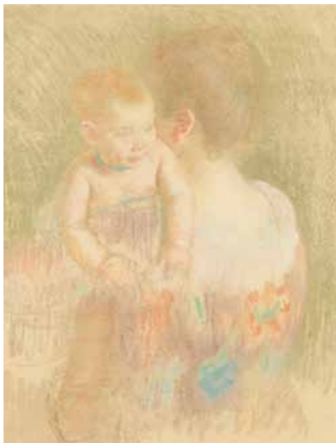
MARY CASSATT Baby Charles Looking Over His Mother's Shoulder (no.2)