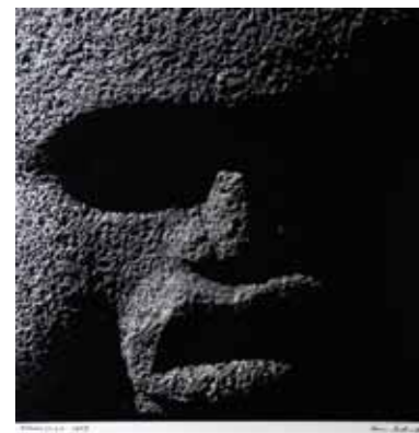
AARON SISKIND OLMEC (I) 2