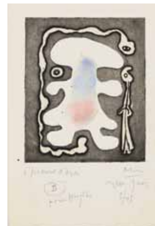
JOAN MIRÓ, L'Antitête B , 1947

Purchase with funds from the Collection Society