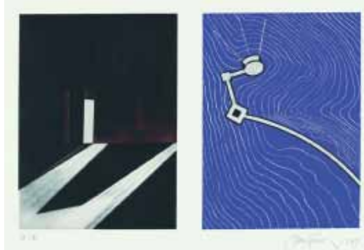
James Turrell: Mapping Spaces Mapping Spaces 4, 1987 Mapping Spaces 2, 1987