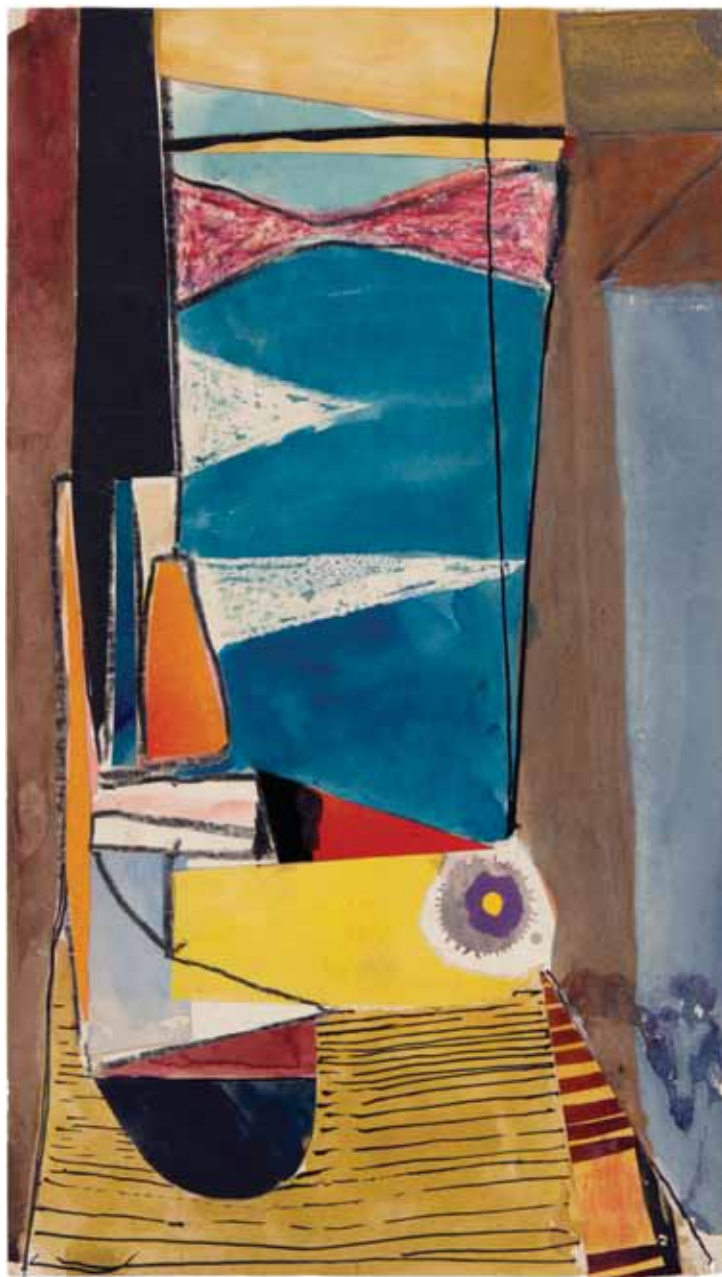
Richard Diebenkorn: Beginnings 1942–1955 Untitled, c. 1946