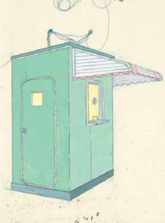
Amze Emmons: Pattern Drift The Study of the Rules Governing Exceptions 005 2014 (detail)