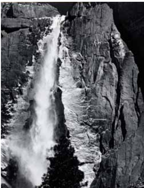
ANSEL ADAMS Upper Yosemite Falls–Spring

ANSEL ADAMS , (1902-1984) El Capitan , 1952 Gelatin silver print Gift of Geoffrey B. Biddle Upper Yosemite Falls–Spring , 1946 Gelatin silver print Gift of Geoffrey B. Biddle