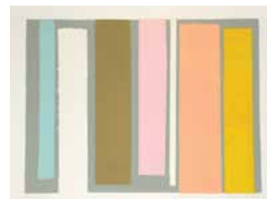
TERRY PARMELEE Serenity I , 1985